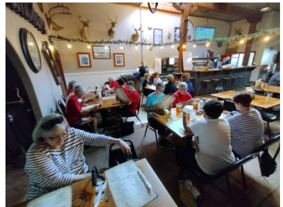
Having lunch at the Wildflower Café in Mason.